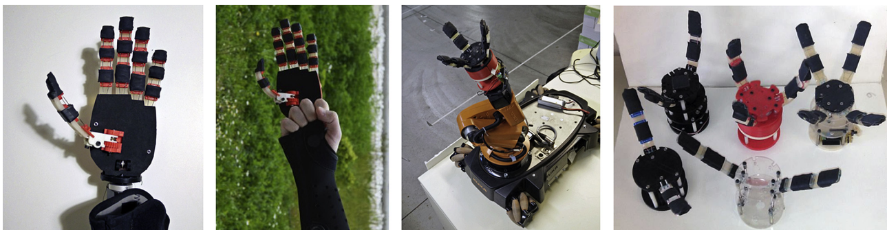
Fig. 1. The OpenBionics prosthetic and robot hands.