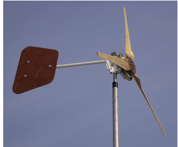
Fig. 2. A locally manufactured small wind turbine of rated power 600 W at 10 m/s, able to produce energy of 1270 kW h/year at a 5 m/s mean wind-speed location.

Additionally, when the net present cost of a locally manufactured small wind turbine and a commercial equivalent are compared (Fig. 3), it is found that locally manufactured technology can offer savings of 20% over the lifespan of the system (Sumanik-Leary et al., 2013). Similarly, the locally manufactured small wind turbine has a significantly lower electricity cost than the commercial turbine, with a Levelized Cost of Energy at 0.95$/kWh, as opposed to 1.23$/kWh of the commercial equivalent (Sumanik-Leary et al., 2013). Since locally manufactured small wind