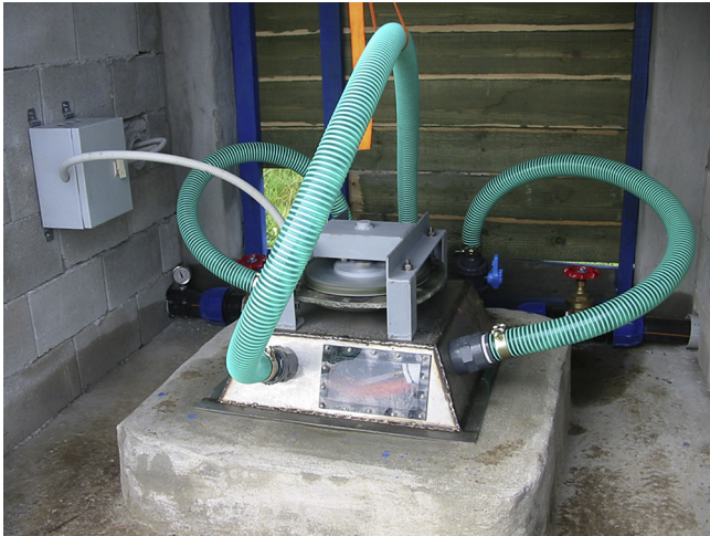
Fig. 4. A 500 W locally manufactured pico-hydroelectric plant.

pico-hydroelectric casings and low-cost turgo runners of Joseph Hartvigsen (Cobb, 2011).